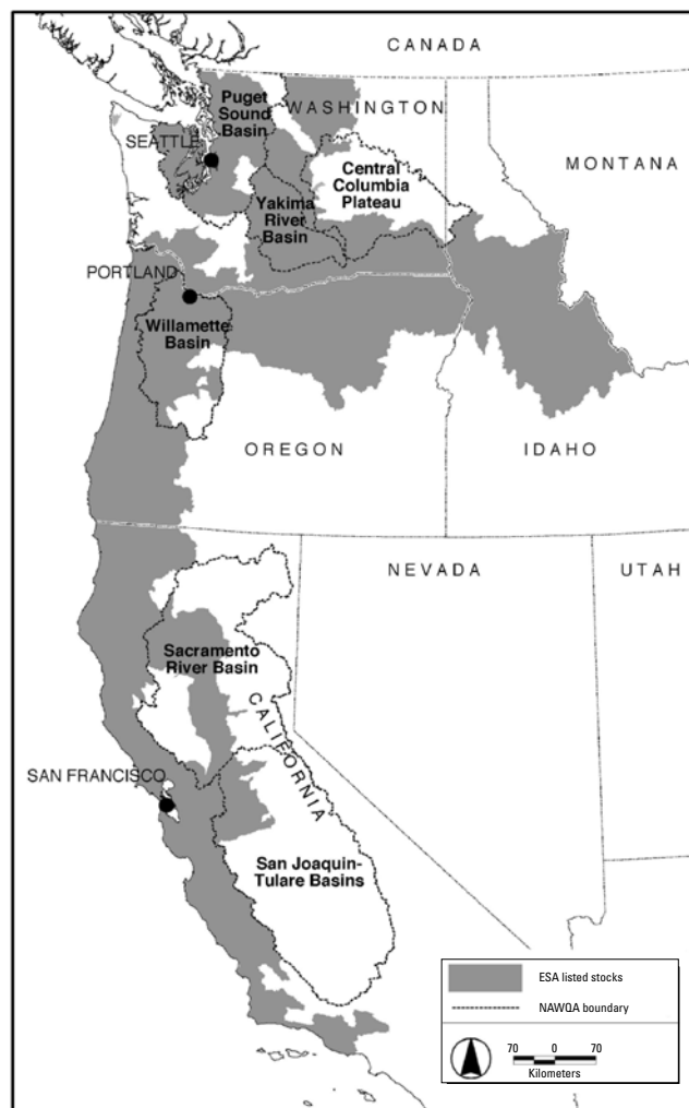
Figure 1. The geographic distribution of threatened and endangered salmon in the western United States overlaps with study units from the USGS NAWQA program. Dashed lines mark the boundaries of NAWQA study areas where pesticide concentrations have been measured in surface waters. Gray shaded areas show the freshwater range of ESA-listed salmon populations.

renewal schedule. Animals were not fed during the exposure interval. After exposures, fish were terminally anesthetized by immersion in MS-222 (tricaine methanesulfonate, 5 g/L; Sigma Chemical Co., St. Louis, MO) until gill activity ceased. Brain tissues were removed, put into plastic microcentrifuge tubes, and kept on ice until stored in a cryogenic (–80°C) freezer for subsequent analyses of AChE enzymatic activity. In the three mixture exposures where mortality was observed, dead fish were